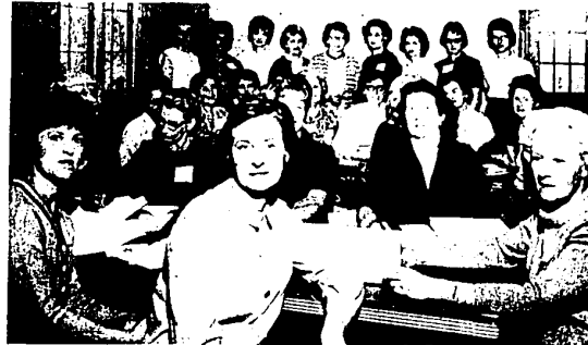
AMERICAN FIELD SERVICE CHAPTERS' dance committee address invitations to their fourth annual Evening Gala dinner dance to be held April 16, at the Armenia Cultural Center. Buffet will be served followed by