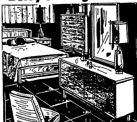
4 PIECE BEDROOM GROUPING Triple dresser, mirror, panel bed and night stand. Comes in a fashionable walnut finish with marble top. Cash available $199.