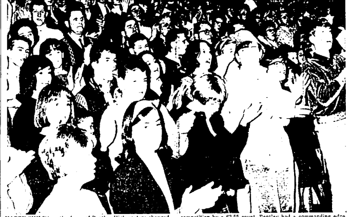
HAPPY SMILES on the faces of Bentley High rooters changed to sad looks when their team fell behind in the second half of the regional final with Fordson High and then faded out of competition by a 63-35 count. Bentley had a commanding edge at halftime but couldn't cope with the Dearborn quintet in the final two periods.

Channel 50 which also will carry Friday's Class A semifinal title. Here are the pairings for this Wednesday's quarterfinals: CLASS A Mumford vs. East Detroit, Ann Arbor vs. East Lansing, Fordson vs. Ferndale, Grand Rapids Catholic vs. Alpena. CLASS B River Rouge vs. Holt, Shrine vs. Marysville, Allegan vs. Grand Rapids East Christian, Belding vs. Ishpeming. CLASS C Visitation vs. Flint Holy Redeemer, Middleville vs. Leslie, Saginaw SS Peter and Paul vs. Scottville, L'Anse vs. Traverse City St. Francis. CLASS D Grosse Pointe University School vs. Covert, Flint St. Mary's vs. Maple Grove St. Michael, Trout Creek vs. Ellsworth, Ellsworth vs. Freeland.