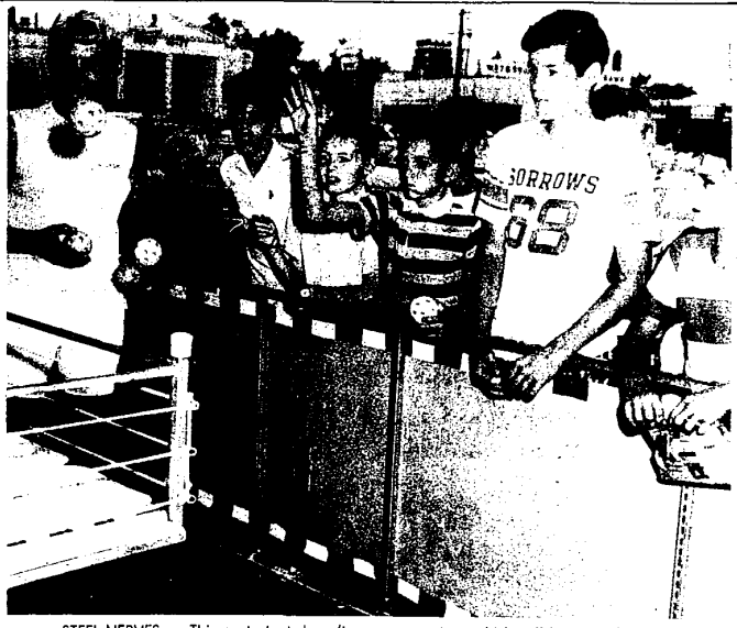
STEEL NERVES — This contestant doesn't even flinch while testing his skill at one of the concessions which will be open throughout the area on all three days of the festival.

Special Sale on all Pianos Spinets — Consoles — Players