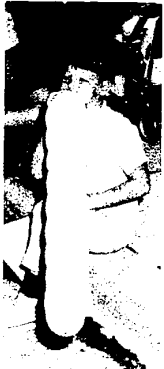
HUFF, PUFF... Balloons will be a common sight at the Founders Festival parade which begins at the Grand River Drive-In Theatre at 10 a.m. on Saturday, July 27

Right here in the center of things at Downtown Farmington Center