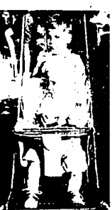
FESTIVAL TIDBITS —They lots always make good pictures at the Plymouth Fall Festival. Your photographer caught these brothers (above) enjoying a knock-out without the bun. The little lassie (below) enjoys core on the cob on her first birthday. Sunday at the Fall Festival baby!