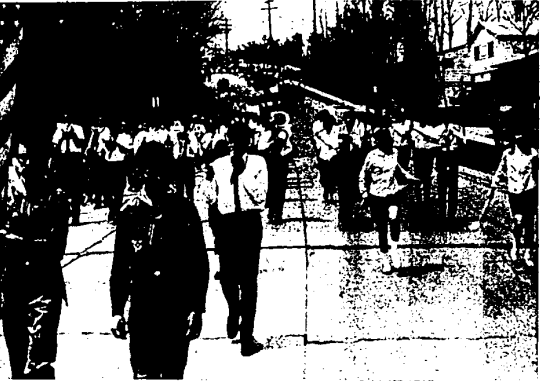
THE LITTLE LEAGUE PARADE which opened the baseball season officially for youngsters in Farmington last Saturday was led by a Boy Scout color guard followed by the Farmington Junior High School Band. Players from the Little League Minors, Majors and Tee-Ball leagues all participated in the parade, which started at the Masonic Temple in downtown Farmington and marched to the City Park where opening game ceremonies were staged with local officials taking part.