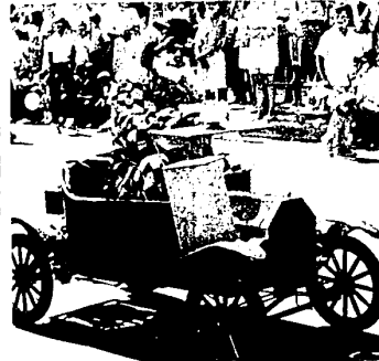
WHAT GOOD IS A PARADE without clowns. The Festival procession certainly had its share, and here is one of the most colorful.