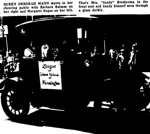
THIS ANTIQUATED AUTO belies the work of the League of Women Voters who keep Farmington very much up-to-date on candidates and issues in the local elections.