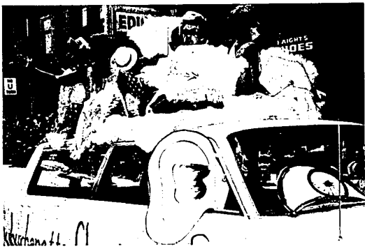
SWEET ADELINES continued to serenade the spectators all along Saturday's parade route.