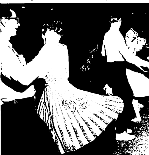
FINAL DOINGS of the three-day Festival was a square dance in the parking lot of the Downtown Shopping Center. Whirling skirts and happy smiles seem to indicate that a gay time was had by all.