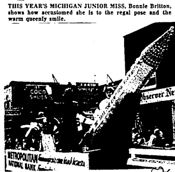
METROPOLITAN NATIONAL BANK honor the young people of Farmington with their parade entry. Symbolically it proclaims that Farmington youth will skyrocket to fame and fortune.