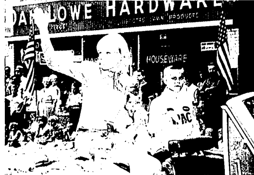
MARTA KRISTEN, Farmington's "Lost in Space" girl, returns home for a triumphal appearance in the Saturday morning procession.