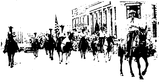
PROVIDING THE NECESSARY prancing the Farmington Township Auxiliary Police, steed element to Saturday's parade are