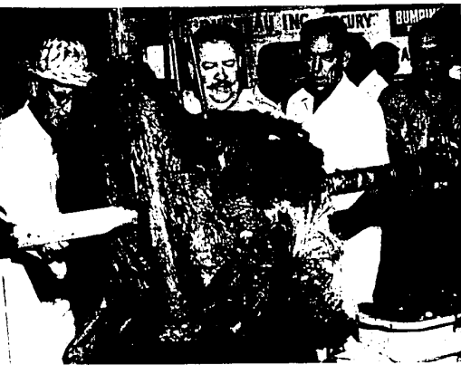
ASSORTED ELKS tenderly baste the black point of the ox roast which was a big attraction at the Festival. The roast is rapidly disappearing into hundreds of tasty sandwiches at this point.