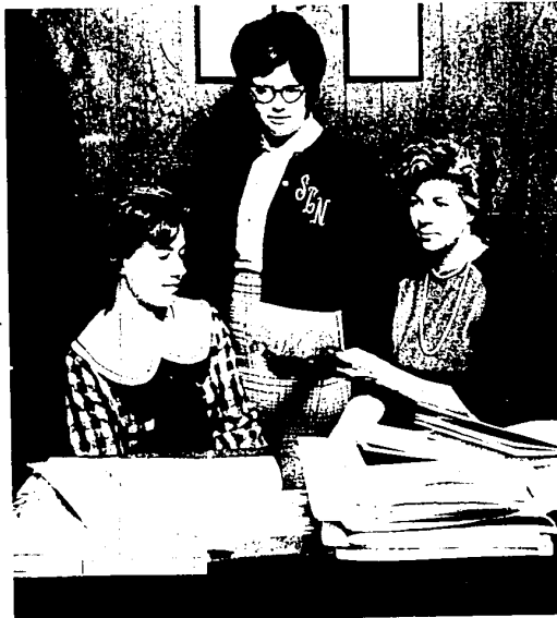
FARMINGTON'S JAYCEE Auxiliary in cooperation with the Greater Farmington Board of Commerce has compiled a list of organizations for the total area. It consists of 101 groups including PTA's, social clubs, homeowners' associations, fraternal