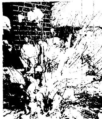
SNOW CAME TO FARMINGTON again last week in full measure. It transformed bushes such as this one into something that might be growing in a cotton patch.

While Americans prefer a wedding ceremony before friends and relatives, followed by a reception, weddings are still dramatically athletic among some peoples of the world. Gypsies jointly jump over a broom, and Asian swains cart off the bride with the help of the best man. But no matter what the rules, or the tricks used to win the game of love goes on.