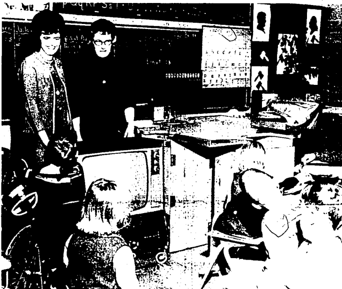
SPECIAL EDUCATION YOUNGSTERS at Eagle School have a new television set to enjoy. Farmington Town Club members presented the children with a large new set last week.