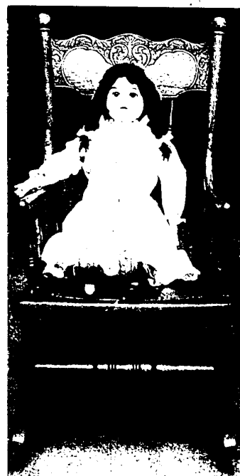
THIS BROWN-EYED brunette is now a collector's item as her head is made of bisque and her body of kid. She is wearing a handmade outfit formerly worn by a baby of six months.