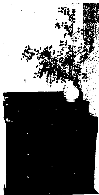
AN HEIRLOOM CHEST of beautifully burlled walnut graces an upstairs hall. It has been a Heeneys family treasure for many, many years. The weeds in the pitcher were collected on the property and would bring joy to the garden club enthusiasts hereabouts; they winter so well.