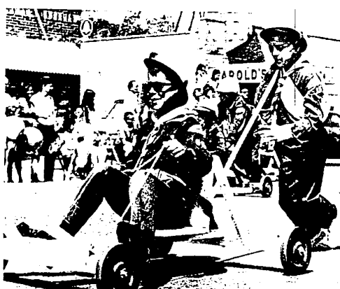
NOTHING LIKE a parade to bring out the best and sometimes the worst in youngsters—none receive more enjoyment in watching a marching procession than kids. This series of shots taken by Observer Photographer Robert Dillon shows exactly how youngsters act at a Memorial Day parade. The pictures were taken at the recent celebration in Redford Township.