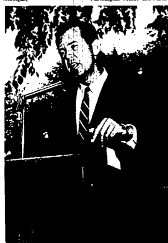
LT. GOVERNOR WILLIAM MILLIKEN was the featured speaker at the 1966 Founders Festival. This year's featured speakers following the parade on Saturday are: U. S. Senator Philip A. Hart (D) and 19th District Congressman Jack McDonald (R).

Grand River at Liberty Street • Farmington • GR. 4-4131