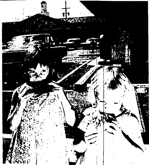
WATERMELON is best when you don't have to worry about all the juice. These two young ladies aren't letting the thought of dirty dresses bother them while they enjoyed the Scepticist watermelon during last year's Festival.

The Grand River Avenue that now goes through Farmington is not the original route of the Detroit to Grand Rapids road. Originally in the 1830's, the route followed what is now US-12 from Detroit to Pontiac, Troy and Stony Creek. The Quakers came about the time Michigan became a state. In the early 1830's, strong abolitionists, the Quakers were highly active in the Underground Railroad that spirited Southern Negro slaves to freedom before the Civil War.