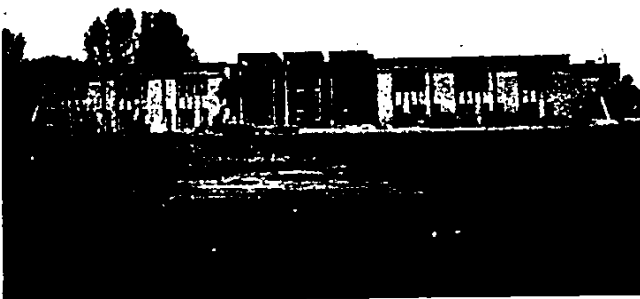
POWER JUNIOR HIGH TO BE COMPLETED IN 1968

Stretching and growing together to this remarkable extent can be a real adventure in community cooperation.