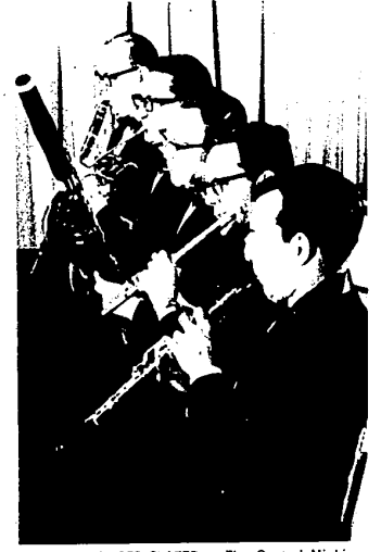
PERFORMANCES SLATED -- The Central Michigan University's Faculty Woodwind Quintet will make a three-day tour of the area beginning March 20. Performances are scheduled for Bentley High School in Livonia, Wayne Memorial High School and Novi High School.