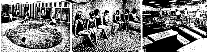
Exclusive new Hot Whirlpool Mineral Spa — diatase care and fatigue. Melt pounds away in authentic Finnish Sauna Steam room. Over $200,000 of patented fitness apparatus give results quickly.

Don't be disappointed by promises or imitators — our facilities are unsurpassed and are available NOW!