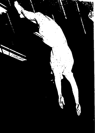
UP AND OVER — Denise Milne got the power for this back flip from a bounce on North Farmington High's trampoline.