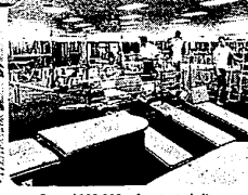
Over $200,000 of patented fitness apparatus give results quickly.