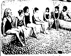
Melt pounds away in authentic Finnish Sauna Steam rooms.