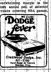
Crestwood Dodge, Inc. 221-5700 Ford Road at Vandy Garden City

The 35-year-old Ionia graduate was the winner by an overwhelming margin in the sixth annual poll of selected writers covering NBA games.