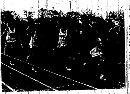
ALWAYS A HIGH SPOT in any dual track meet is the 880-yard relay. This shows Steven and Benley tracksters exchanging batons in the second lap of the event at opening meet of the Observeland campaign.

The Rangers' got goals from Gerry Cheevers, Harry Howell and Rod Gilbert intruding Chicago.