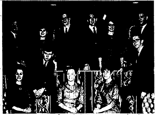
TO SING CONCERT — These young people are known as The Heralders, a musical group from the Grand Rapids School of the Bible and Music. They'll appear at the Covenant Community Church in Redford Township April 21.