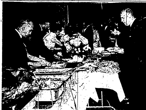
BIG EVENING — Members of the Farmington Elks Club celebrated the opening of their new lodge building on Orchard Lake Rd. June 15 with a buffet dinner and installation of new officers.