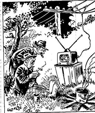
"Aw, dem bums can't wrestle!"