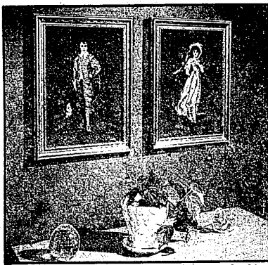
Rich beauty is given the home by famous paintings reproduced in needlepoint. "Blue Boy" from the painting by Sir Thomas Gainsborough, and "Pinkie" from the painting by Sir Thomas Lawrence, pair well for wall area above a table.