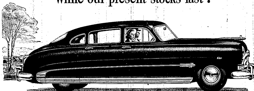
Fabulous Hudson Hornet—ten-time winner in 1951 National Stock Car Races!

Buy Low at the Old Price while our present stocks last!