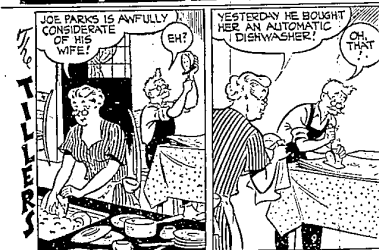
Ticklers By George