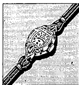
Glass and elegance are combined in this Elgin Delux carved crystal, 17 jewels. $5500