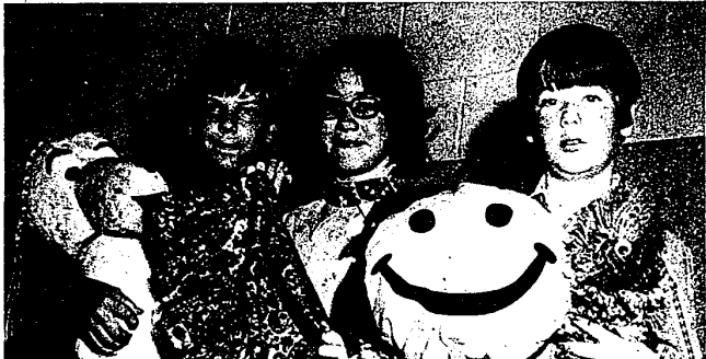
FUN FAIR SUNDAY -- Kenbrook Elementary School of Farmington will sponsor the annual Kenbrook fun fair Sunday, May 7, from 12:30-4:30 p.m. at the school. An "electric derby" will feature prizes for the winner plus there will be a midway, cake walk, bake sale, country