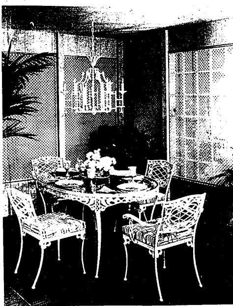
FILIGREE PANELS overcome the disadvantage of scarce natural light. To soften and diffuse daylight, instead of curtains or blinds, framed panels of filigree hardboard are used. For partitions, the panels are open to both illumination and air movement.