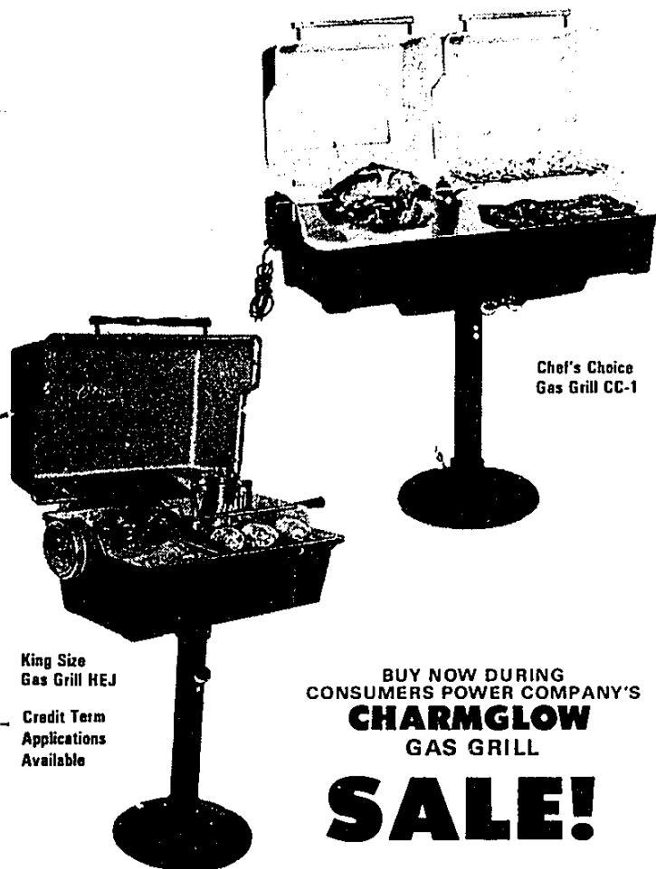
Chef's Choice Gas Grill CC-1

A Charmglow gas grill lets you enjoy all the fun of cookouts without the muss and fuss of an old-fashioned charcoal fire. You'll still get that same barbecue flavor because barbecue flavor is a result of the smoke of meat juices dripping on hot briquets. With Charmglow's long life "Charm-Roks" you enjoy barbecuing perfection plus the speed and dependability of modern gas!