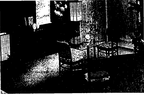
A DINING ROOM can be light, airy and therefore a better setting for more pleasurable meals. Oriental accents lend dramatic interest to moderately simple design. The oriental theme is carried out in the walls of deep-toned Masonite brand Brazilian rosewood paneling. The room's one large glass window area is covered by sliding screens of filigree hardboard, eliminating draperies or curtains and giving the room a bright, open feeling.