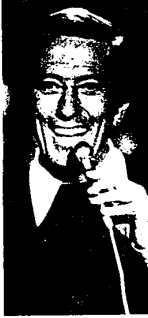
ANDY WILLIAMS will mark the official debut of the Pine Knob Music Theater at 8:30 p.m., Tuesday, June 27. He'll be there through July 1. The outdoor theater, at 1-75 Sashabaw Road, will host top-name entertainment throughout the summer. Tickets are on sale at Hudson's.