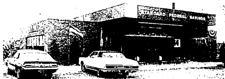
NEW OFFICE -- Standard Federal Savings and Loan opened a new office recently at 25950 Middle Belt Rd., Farmington. Regular office hours will begin at the new branch July 17.

children aged 8 to 11 years and $1.75 for those aged 12 to 15 years. This does not include the price of entertainment on the island. Parents are welcome. Interested youngsters can pick up registration forms at the following schools: Cloverdale, Gill Road, Shawassee and William Grace in the south end and Bond, Middlebelt, Wood Creek and Ten Mile in the north end.