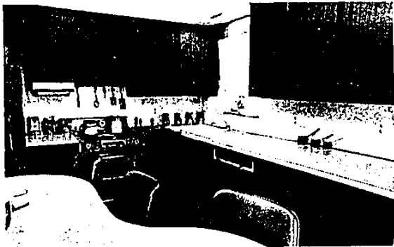
KITCHEN RENOVATION -- Bob Haas was not satisfied with the old cupboards. First he covered the old doors with paneling then added the molding with mitered corners. The molding was stained and elegant new hardware installed. He built the snack bar (lower left) and topped it with avocado and white Formica flecked with gold to match the avocado appliances. The counter tops match.

DO feel free to add moldings, wood beams and other architectural details to make a plain room look less boxy.