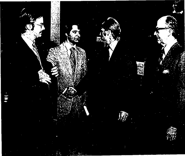
CROWLEY'S OPENING -- A new name went on the shopping center at 12 Mile and Farmington Rd. in Farmington Township when Crowley's opened their new store on the site.

CUTBACKS REDUCED extracurricular activities, field trips, athletics, maintenance and library services. Many teachers were laid off. A preliminary budget of $17.5 million which anticipated $1.2 million from a 3.5 mill increase, was drawn up in March, but residents rejected the millage by a narrow margin in April. A new preliminary budget of $16.6 million was presented in June, reflecting the loss of the millage and the increase in SEV. Prisk predicts a higher turnout at this year's hearing. "I've been here four years and I could count on both hands the number of people who have come to the budget hearings," he said. "One year only one person came." He said public attendance has increased at regular board meetings lately, and he expects about 25 people at this year's hearing.