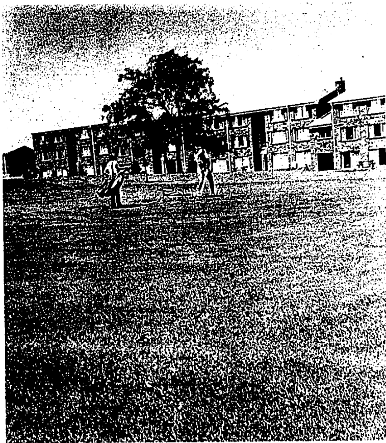
GOLFERS at Independence Green in Farmington need only step out their front door to be on the green.