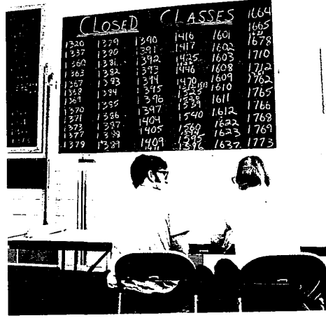
"NOW WHAT DO WE DO?" ask these Schoolcraft students after observing all the classes which were closed by the time the college's final registration began this week. Classes begin Thursday with late registrations accepted until Sept. 5.

be drive-in stands, but clever new zoning ordinances have prohibited drive-ins. The young people nevertheless are highly mobile. If they don't own their own cars, they can get a family car or pile in with friends. They turn up their noses at municipal boundaries and share none of their parents' snobishness. They are a separate social class. A different set of attitudes toward work, money, religion, politics has been deliberately cultivated and absorbed. Despite the old bromide that "kids have always been like that," this generation is in fact different. Given this social function of parks, given the young people's different attitudes about laws and ordinances, the whole matter is complicated by the young people's tendency to accumulate in groups of several hundred, be it in Detroit's Stoenep Park, Livonia's Botsford Park, Cass Benton Woods, "The Horseshoe" or Northland. The point here is that the parks problem is more than a problem of acreage and picnic tables. It's a people problem. It isn't solved when (for example) voters in Livonia refuse to put up money for parks or police chiefs in Redford Township and the City of Plymouth want to close parks earlier. "Cleaning out" a park rarely solves a problem, in the overwhelming majority view of the community of "Rap on Parks" participants. In fact, it amounts to municipal failure to meet the needs of a particular social class that the user isn't hurting group. (Next week — some police problems.)