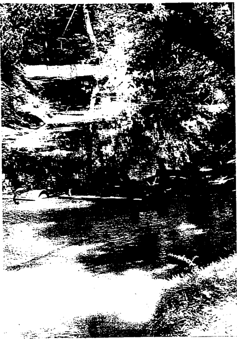
THIS BEAUTY spot could be mistaken for an Upper Peninsula, but the Wayne County parks picnic tables and trash baskets identify the site as the Middle Rouge River near Hawthorne Drive. Jaycees will coordinate a Sept. 16 cleanup project in western Wayne County at the same time a similar Rouge project is conducted in Farmington.