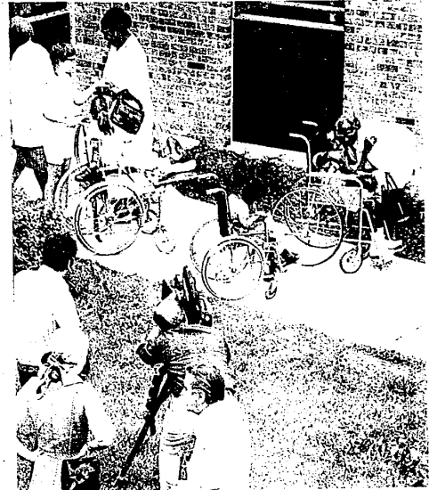
SOME FOSTER grandparents and children at Plymouth State Home and Training School are filmed for documentary on the foster grandparent program which will be shown on television during the fall.

There were 67 projects with 4,400 foster grandparents," she said. "Now there are 140 projects with a goal of over 12,000 volunteers."