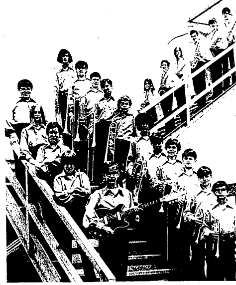
THE 22 MEMBERS of the Clarenceville Junior High School Stage Band are shown on the overpass outside their school. They'll be heard tonight (Sept. 23) on radio.