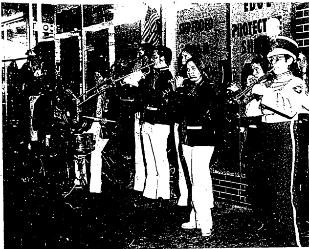
THE FARMINGTON HIGH band has been having a bit of trouble raising money for uniforms, so this group played Saturday in the