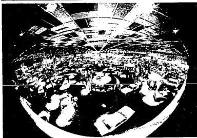
Detroit's 57th Auto Show November 18-26

Detroit has another big date in its continuing love affair with the automobile when the 57th Auto Show - "73 Auto Circus" - opens at Cobo Hall November 18.