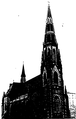
ST. JOSEPH'S CHURCH , the last of the Detroit churches made of native limestone, was visited recently by the humanities classes from Farmington High School.

During the course of the trip the group stopped at Eastern Market for lunch. Time was allowed for browsing as well as to experience the market's circus-like atmosphere.