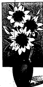
GLORIOSA DAISIES are magnificent for garden decorations or as a cut flower. Sow the seed early, and you will have magnificent displays of blooms the first year.

YOU DON'T NEED a vegetable garden to grow mustard and cress. A shady window will allow you to grow them indoors with ease. Just sprinkle the seeds on a paper napkin and keep moist. Within 24 hours the seed coats will split, and within 10 days the cress will be high enough to cut.