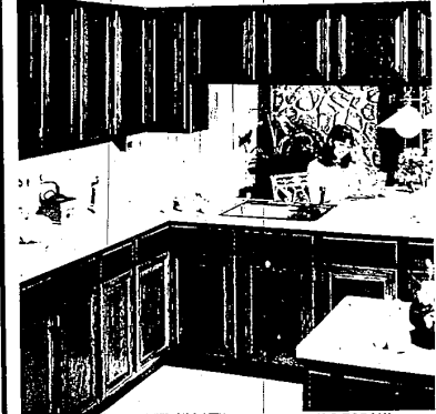
A CAREFREE NEW KITCHEN CAN BE YOURS TODAY! DISCOUNTS UP TO 30% HAAS - 40% CONNERS - 30% RAYGOLD

A NEW KITCHEN FOR EASY LIVING FACTORY FINISHED PANELING