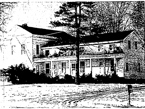
THIS 150-YEAR-OLD Livonia farmhouse, scheduled for demolition to make way for the I-96 free way, has been purchased by Trinity Baptist Church and will be moved close to Schoolcraft College to use as a student center.