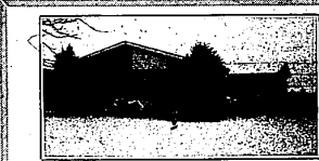
LIVONIA Lovely 3 bedroom ranch with full basement, inground kitchen shaped pool, doorwall to patio, country kitchen, 1 1/2 baths and fast occupancy. Call 261-0700. (Home Service Contract) (18477) $28,900.