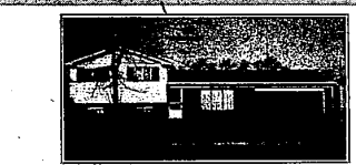
36288 JAMISON — LIVONIA Four bedroom brick and aluminum qud level with full fireplace in family room, oversized 2 car garage. (Home Service Contract) Call 261-2600.