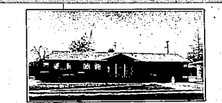
FARMINGTON Walk to schools and shopping from this custom built 3 bedroom ranch on a nice sized lot, both off master bedroom, beautiful landscaping. Call 851-1900. (Home Service Contract) (17371) $38,900.

REDFORD , Sparkling 3 bedroom brick home with all aluminum trim, beautifully finished rec room, large closets, 1 1/2 car garage in low tax Redford. $25,500 Call 324-9510 (Home Service Contract)