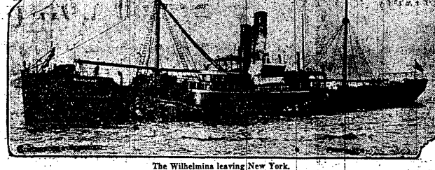
The Wilhelmina leaving New York. The steamer Wilhelmina, flying the American flag, is now on its way to Hamburg with a cargo of provisions consigned to an agent of a St. Louis commission house in Germany. She passed two British mines off outside New York city without molestation. It is believed, however, that she will be seized as soon as she attempts to enter a German port. In case this is done the English will offer to pay the full value of the cargo.