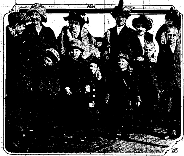
German women and children refugees in San Francisco.