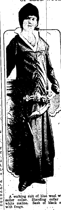
A walking suit of blue wool with sailor collar. Standing collar of white malmale. Sash of black silk with frogs.