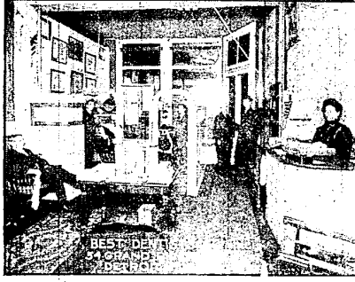
BEST DENTISTS' CO., INC. DETROIT Grand Floor, 34 Grand River Avenue